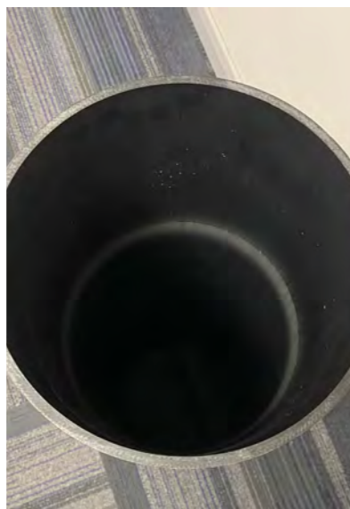
The ducting has a diameter of 225mm