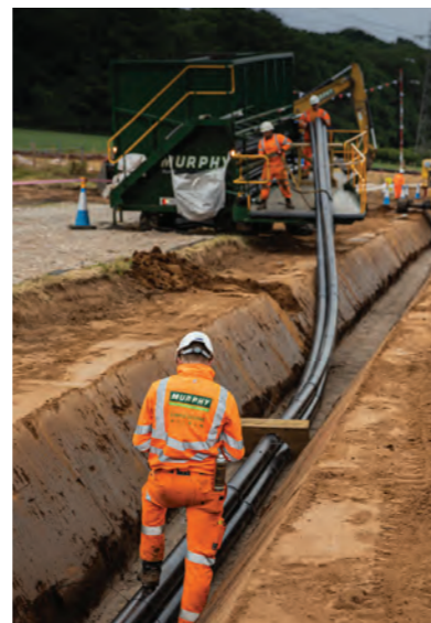
Image 3 shows trenching and cables being laid