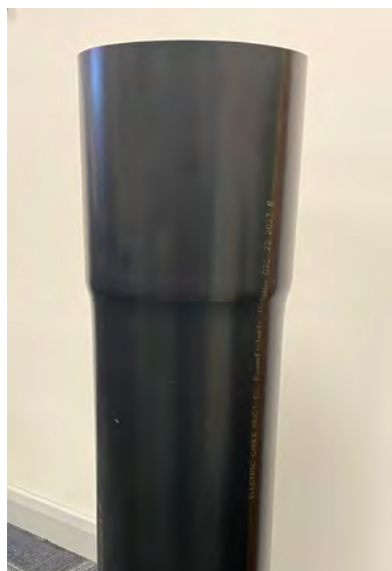
Shows a section of typical ducting