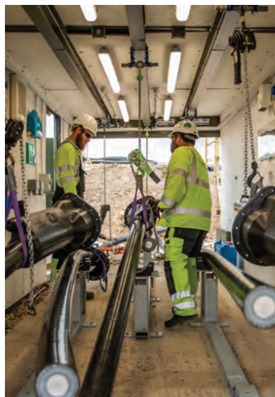
Image 1 shows two lengths of cable being safely jointed

They were displayed on easels at the community drop in event to provide participants with visual examples of the type of construction activity they might expect to see in their area as the Norfolk Zone progresses.