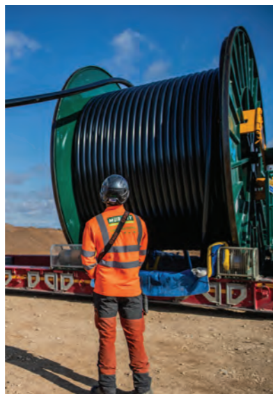
Image 2 shows delivery of a reel of cabling