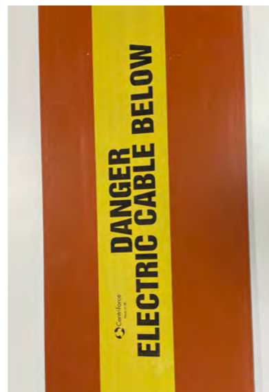
A protective tile is installed above the ducting. Both buried under-