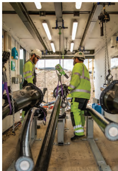
Image 1 shows two lengths of cable being safely jointed

They were displayed on easels at the community drop in event to provide participants with visual examples of the type of construction activity they might expect to see in their area as the Norfolk Zone progresses.