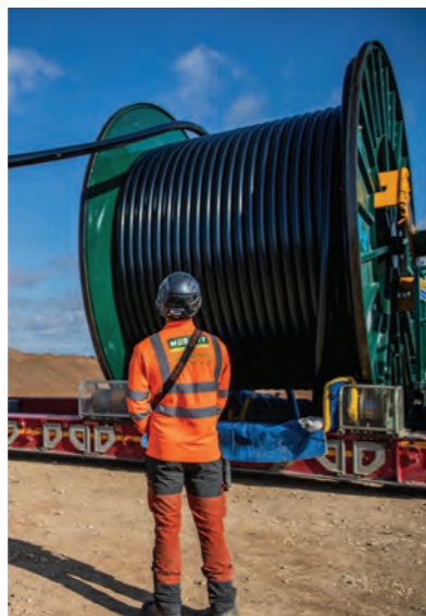
Image 2 shows delivery of a reel of cabling