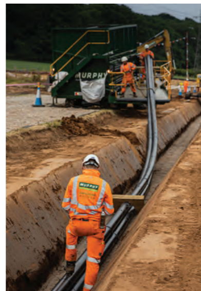
Image 3 shows trenching and cables being laid